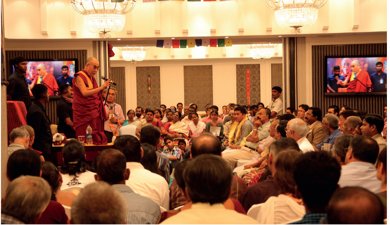
His Holiness the XIV Dalai Lama of Tibet addressing a gathering of Friends of Tibet Members and Beneficiaries of Friends of Tibet Wellbeing Programme on November 25, 2012.

"Even if China reduces us to nothing but ashes, we will rise from the ashes and make a new nation."