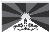
Tibetan National Flag

Tibet lies at the centre of Asia, with an area of 2.5 million square kilometers. The earth’s highest mountains, a vast arid plateau and great river valleys make up the physical homeland of 6 million Tibetans. It has an average altitude of 13,000 feet above sea level. Tibet is comprised of the three provinces of Amdo, Kham and U-Tsang. The Tibet Autonomous Region (TAR) which is actually Outer Tibet was created by China in 1965 for administrative reasons. It is important to note that when Chinese officials and publications use the term ‘Tibet’ they mean only the TAR. Tibetans use the term Tibet to mean the three provinces described above, i.e., the area traditionally known as Tibet before the 1949-50 invasion.